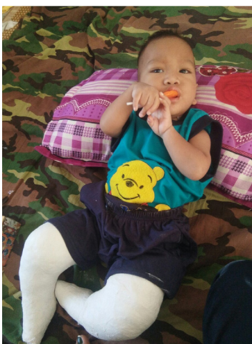
A Khau, after surgery

42 local health workers trained to save children's lives!